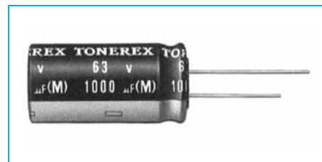
Marking color : Gold print on a black sleeve